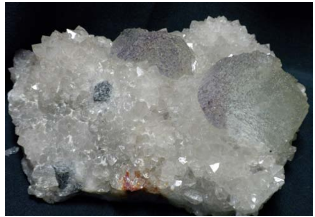
Modified octahedral, color zoned fluorite crystals on quartz from the Blanchard Mine Group