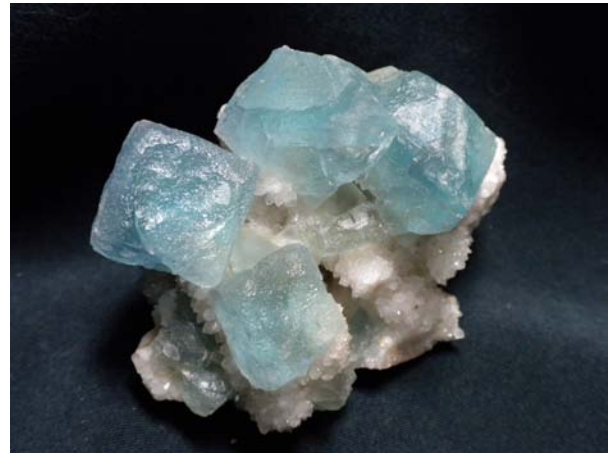
Modified "Blanchard Blue" fluorite cubic crystals

The pieces from the Blanchard Mine seem to be arranged by nature to be attractive. Many have pale white quartz matrixes that accent the vivid fluorite colors. There are associations with galena and other sulfides to add interest and the clarity of some of the crystals is outstanding. If beautiful fluorites with interesting forms and associations appeal to you, I would recommend that you check out those from the Blanchard Mine.