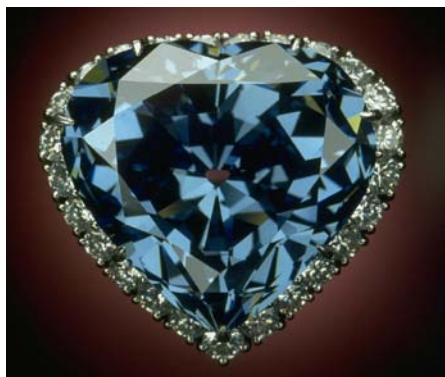
Blue Heart, 30.82 ct

The prices people are willing to pay for naturally occurring, colored diamonds has reached an all time high recently, with blue and pink diamonds selling at up to and over a million dollars per carat at auction. Are these diamonds so rare that they deserve such prices? What causes the rainbow of color we can observe in them? Should we be concerned about synthetic diamonds and natural but treated diamonds? Is such gemological trickery easily distinguishable when contrasted with an untreated, natural colored diamond? All these questions and many more will be answered in this talk!