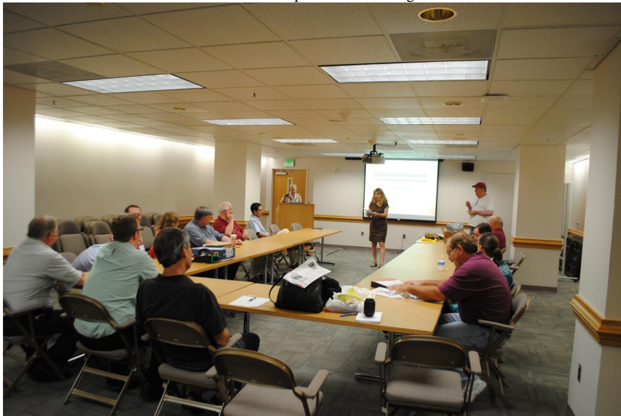
Photos for September's Meeting

Feel free to share this information with any friends who may be interested in expanding or starting a mineral collection.